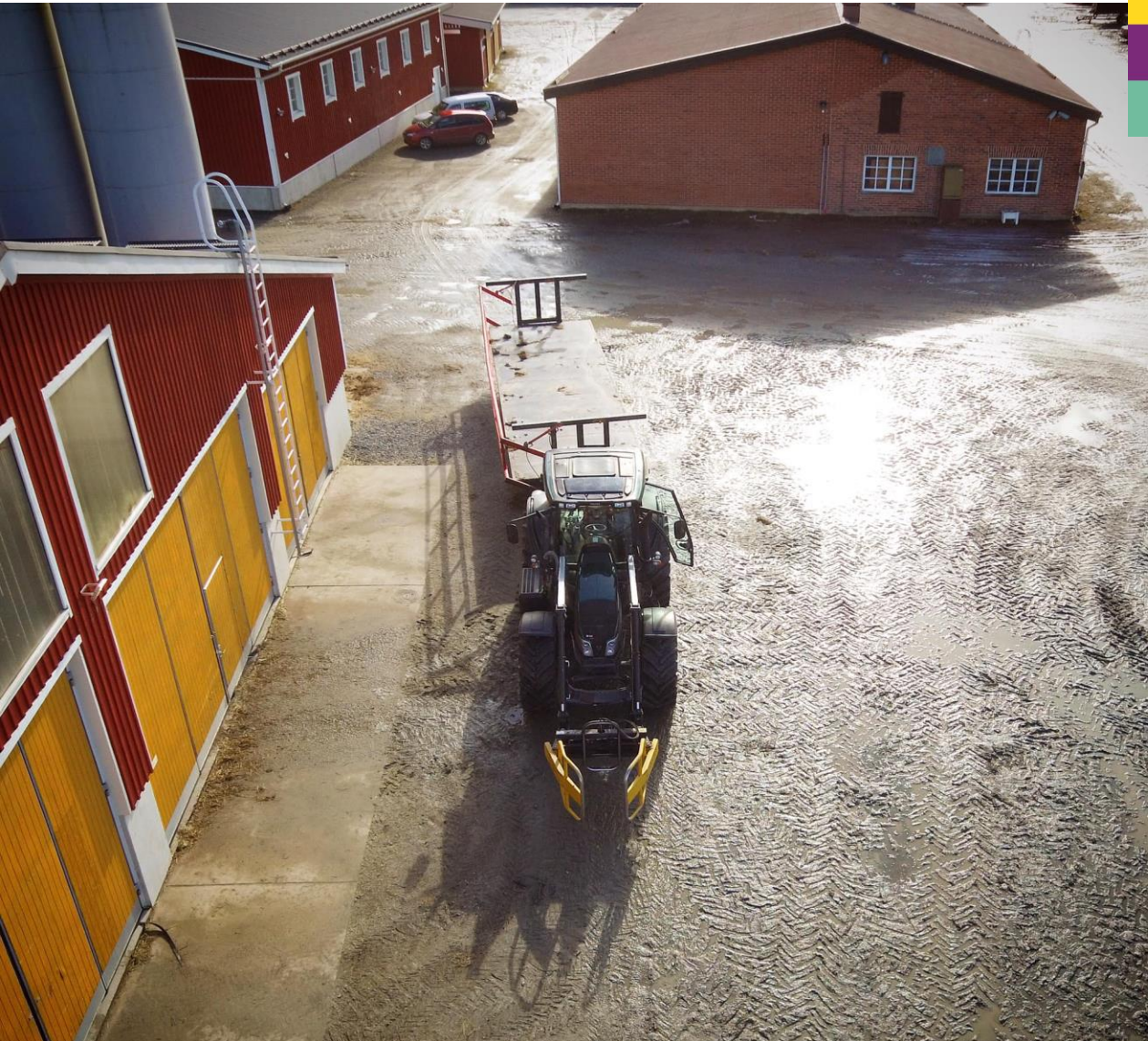
Vuoksi Kyntäjantie Campus

Vocational qualifications in study fields such as agriculture, business and administration, forestry, construction, catering, machinery, media and visual expression, hairdressing, electrical engineering, metal industry, software development, cleaning and property services, animal care and horticulture; altogether 13 study programmes, all accredited by the Finnish National Agency for Education.