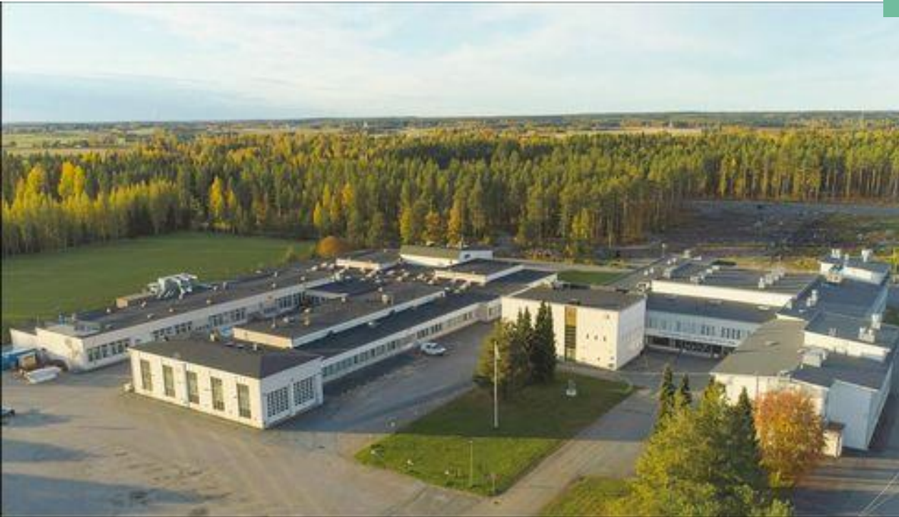
Vuoksi Oppitie Campus

Vuoksi provide and develop versatile and high-quality vocational qualification to promote the well-being of the society, region, and people in close cooperation with employers and their establishments and other interest groups.